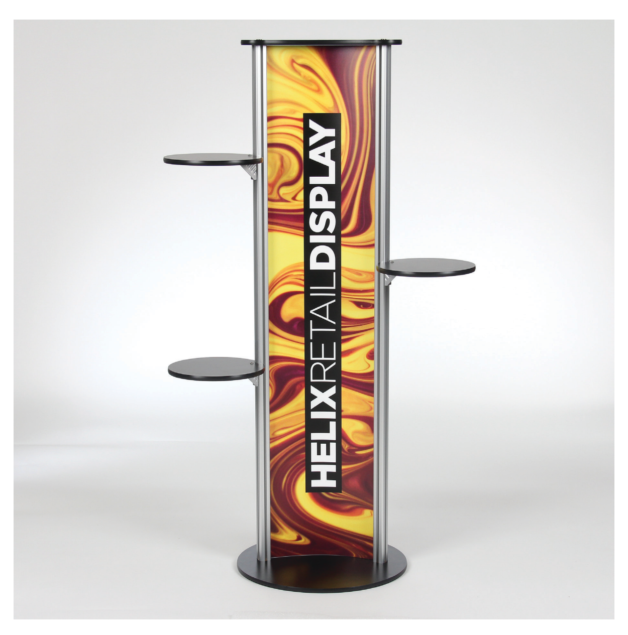
Finish by inserting graphic into channels by applying tension.