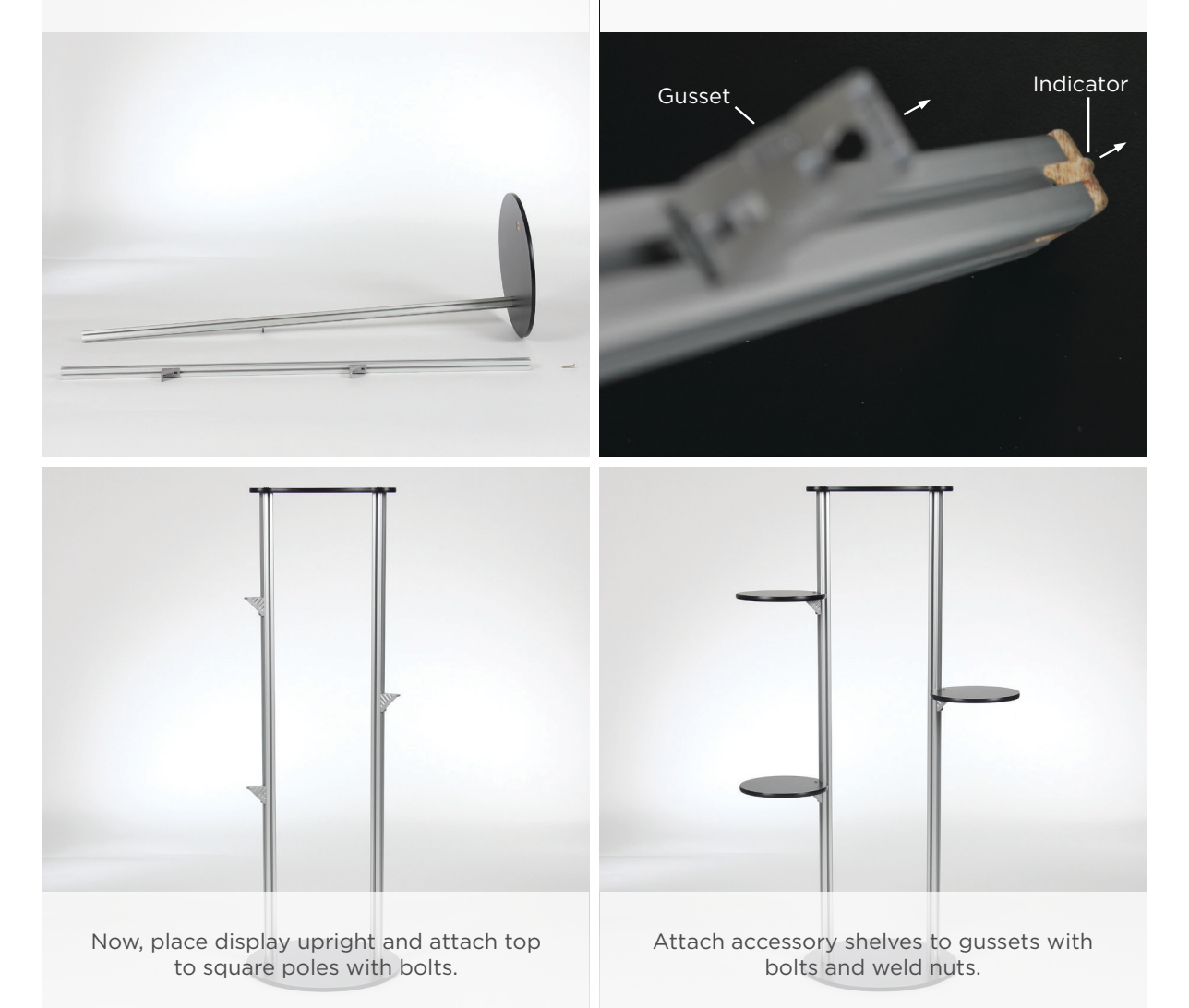
Align gussets in direction of indicator located on base.